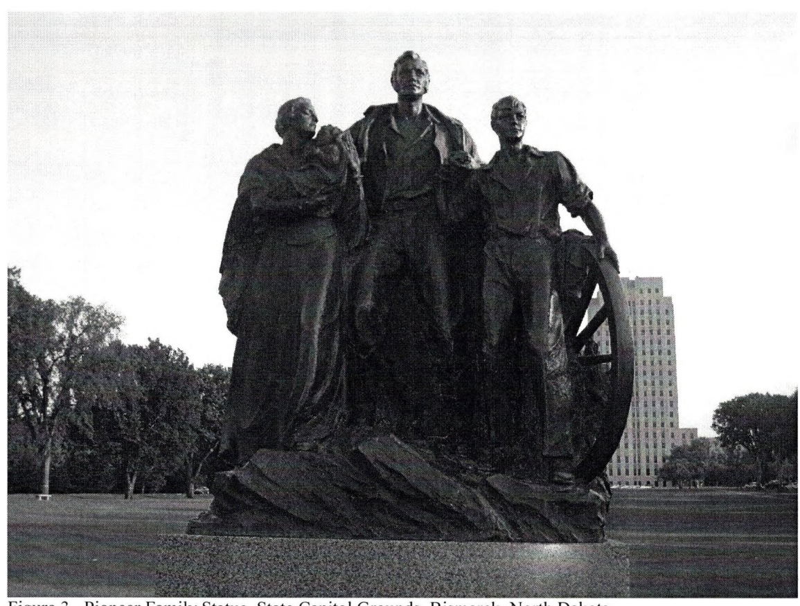
Figure 3. Pioneer Family Statue, State Capitol Grounds, Bismarck, North Dakota