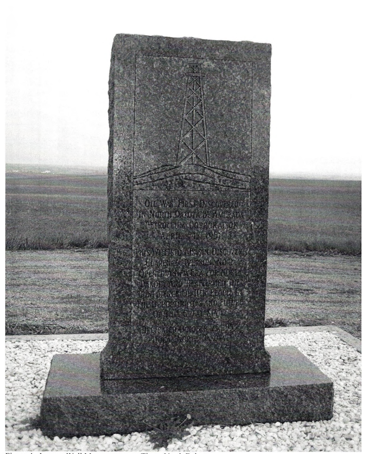
Figure 4. Iverson Well Monument, near Tioga, North Dakota