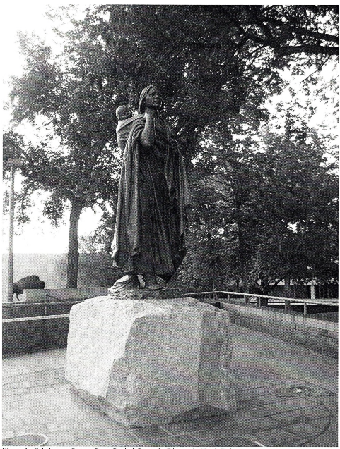
Figure 1. Sakakawea Statue, State Capitol Grounds, Bismarck, North Dakota