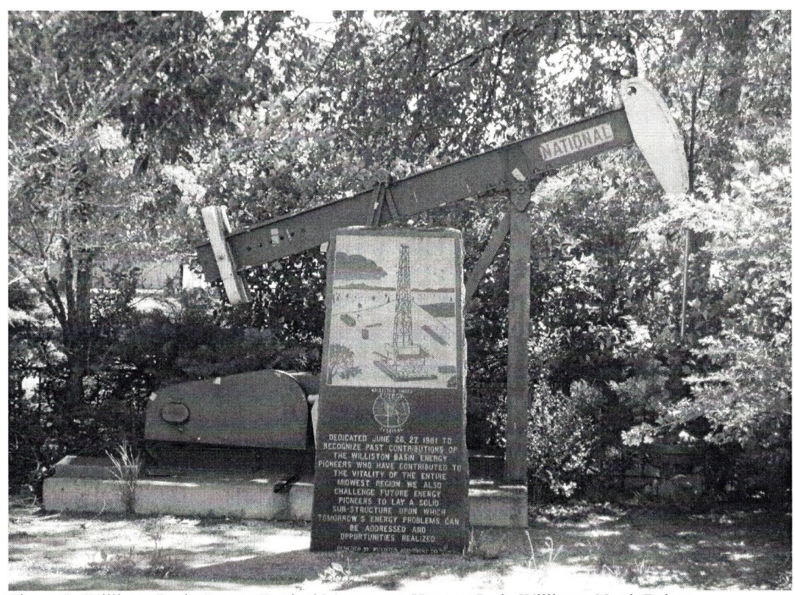
Figure 5. Williston Basin Energy Festival Monument, Harmon Park, Williston, North Dakota